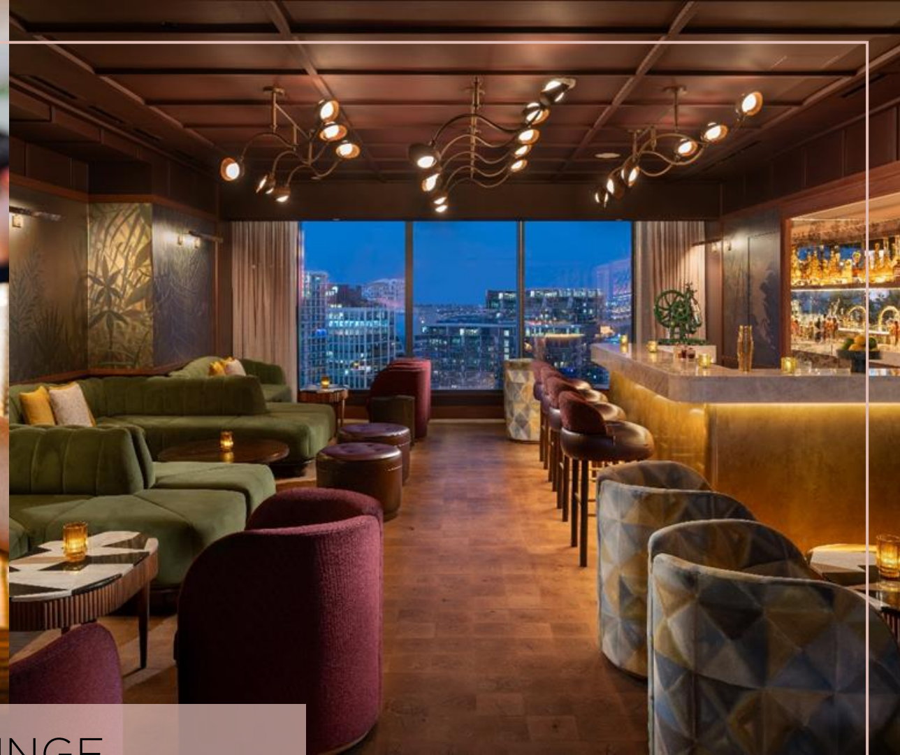
BEACON. TAMPA'S TALLEST ROOFTOP LOUNGE