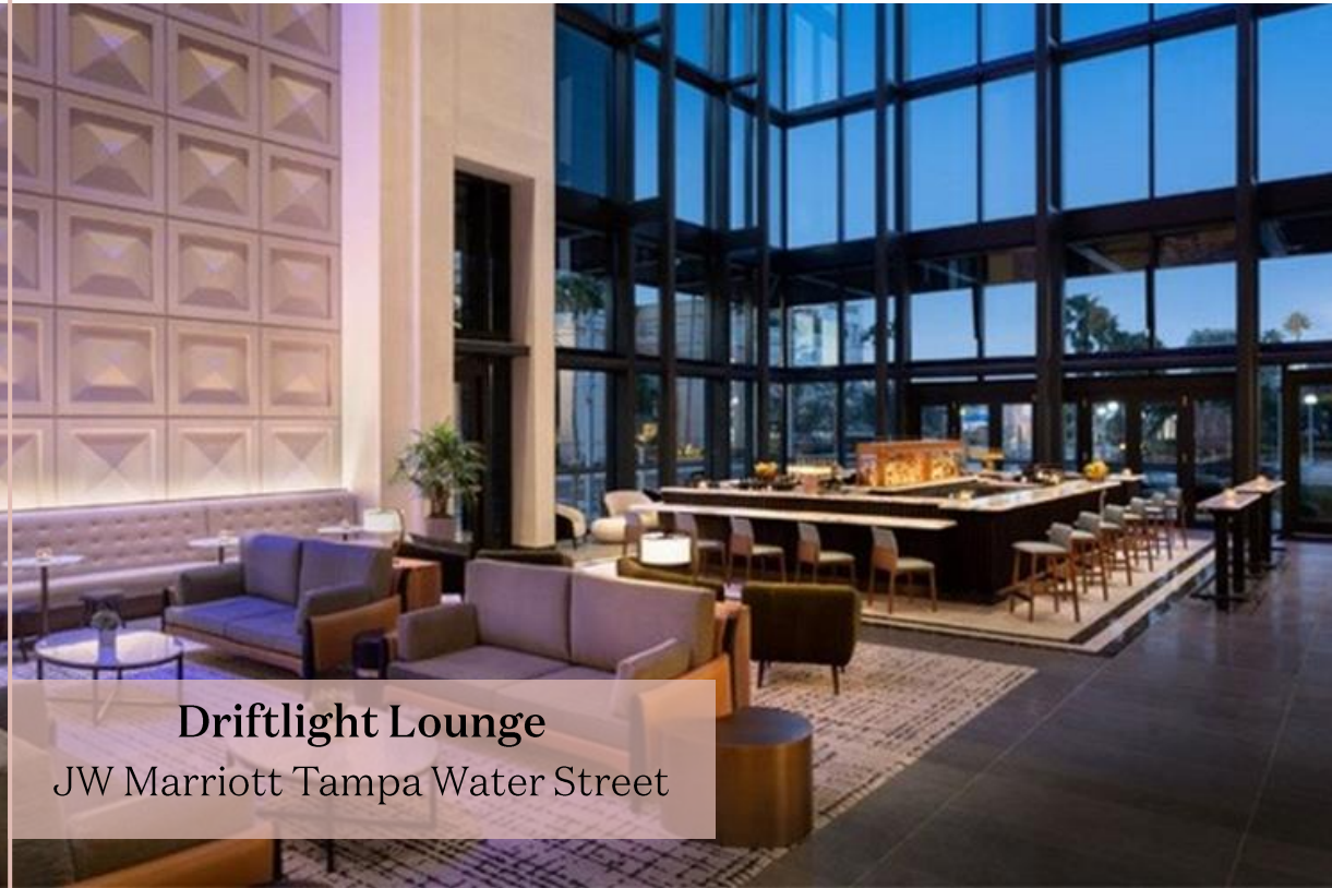
Driftlight Lounge JW Marriott Tampa Water Street