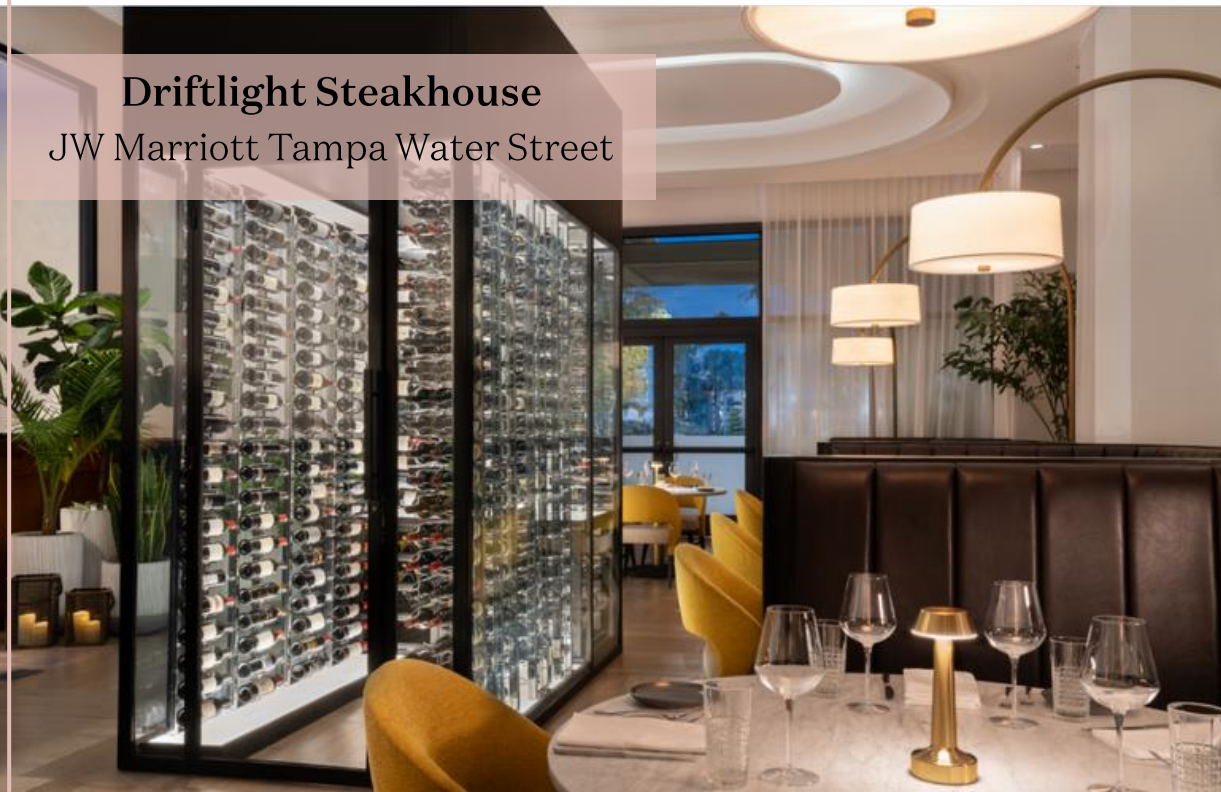
Driftlight Steakhouse JW Marriott Tampa Water Street