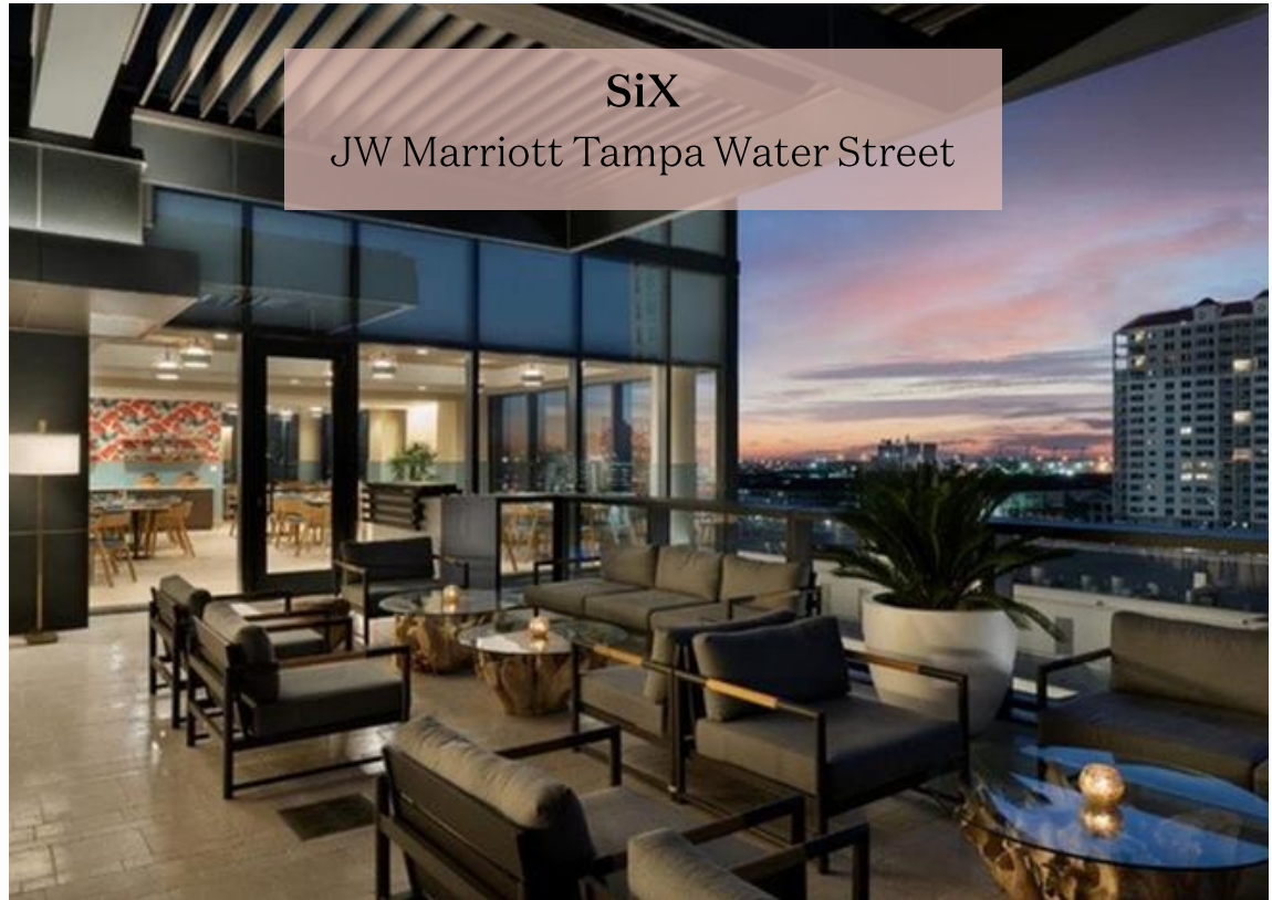
SiX JW Marriott Tampa Water Street