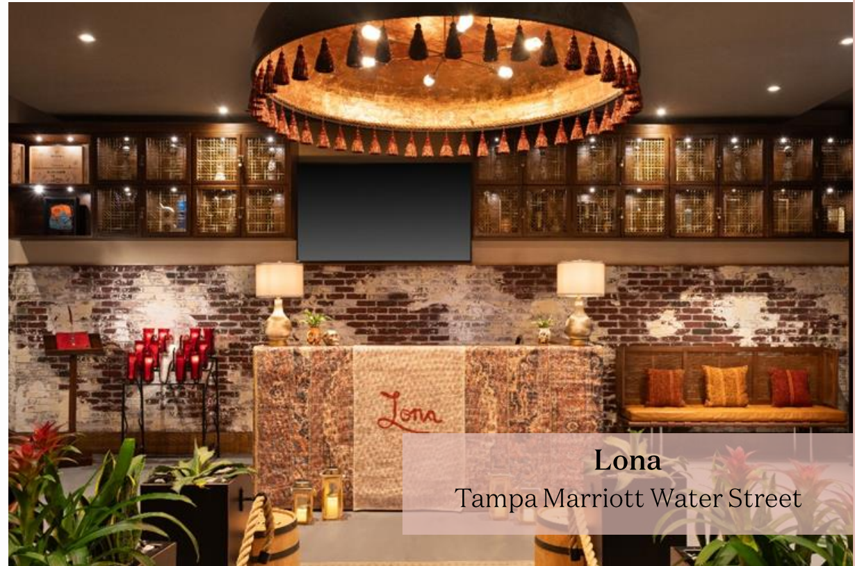
Lona Tampa Marriott Water Street