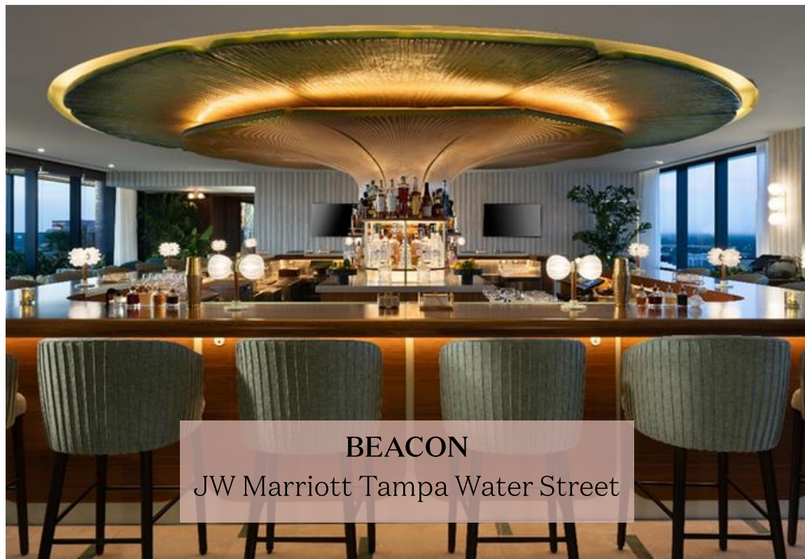
BEACON JW Marriott Tampa Water Street