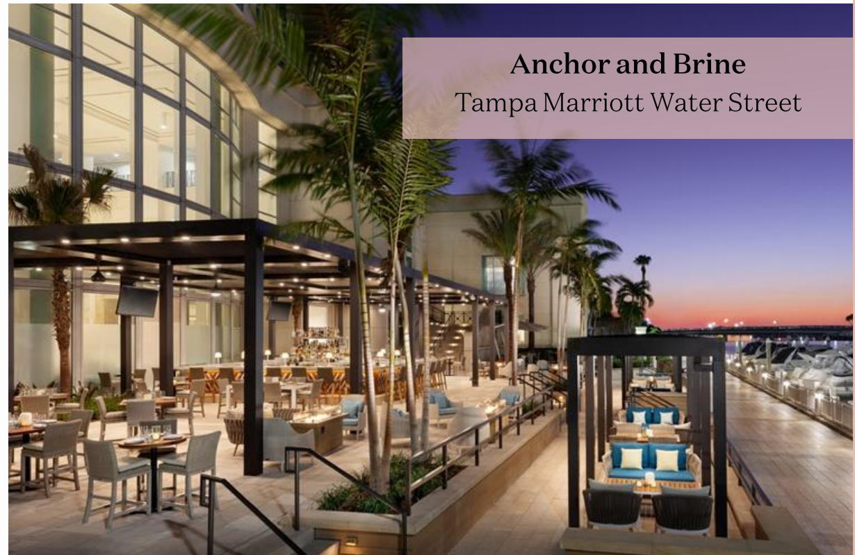
Anchor and Brine Tampa Marriott Water Street