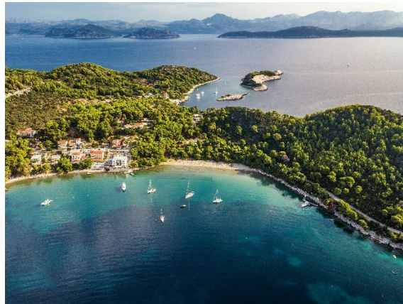
Sapunara, Mljet.