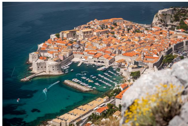
Dubrovnik