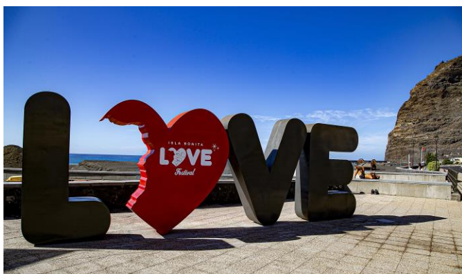
Love festival.

London, 30 June 2025 – Just when the rainbow flag is reluctantly folded away after the Pride Month, the special edition of Isla Bonita Love Festival begins. La Palma is a holiday destination welcoming all visitors because “love is love, no matter who you love”. In a landmark cultural fusion, this year's Love Festival is lovingly paired with Lustral Fest, as part of the programme of events of the Bajada de la Virgen de las Nieves, the traditional celebration which is held every 5 years.