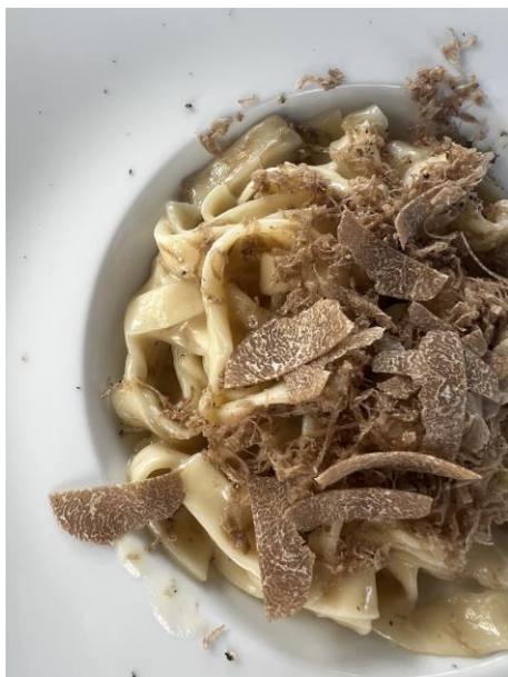
Istrian Truffle Pasta

London, 30 July 2025 – The Croatian National Tourist Board (HTZ) and Great British Chefs (GBC), the leading chef and recipe platform in the UK which showcases more than 250 of Britain's top chef talent, have launched a campaign to spotlight the diversity and breadth of Croatian cuisine.