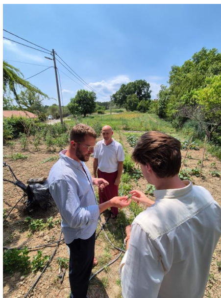
Great British Chefs in action

Throughout the campaign, a series of articles, videos and recipes will showcase Croatia's gastronomic regions, specifically Istria, with longer form features and unique recipes hosted on the Great British Chefs platform soon. Published over the coming weeks, this new offering for the GBC audience will serve as an invitation to discover Croatia through its cuisine.