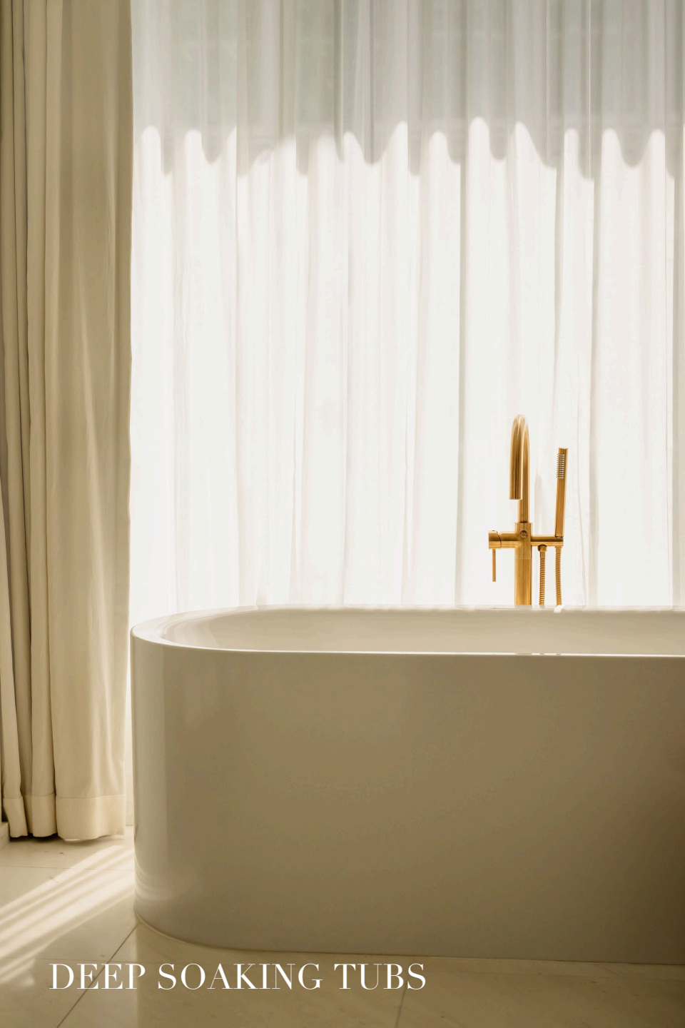
DEEP SOAKING TUBS