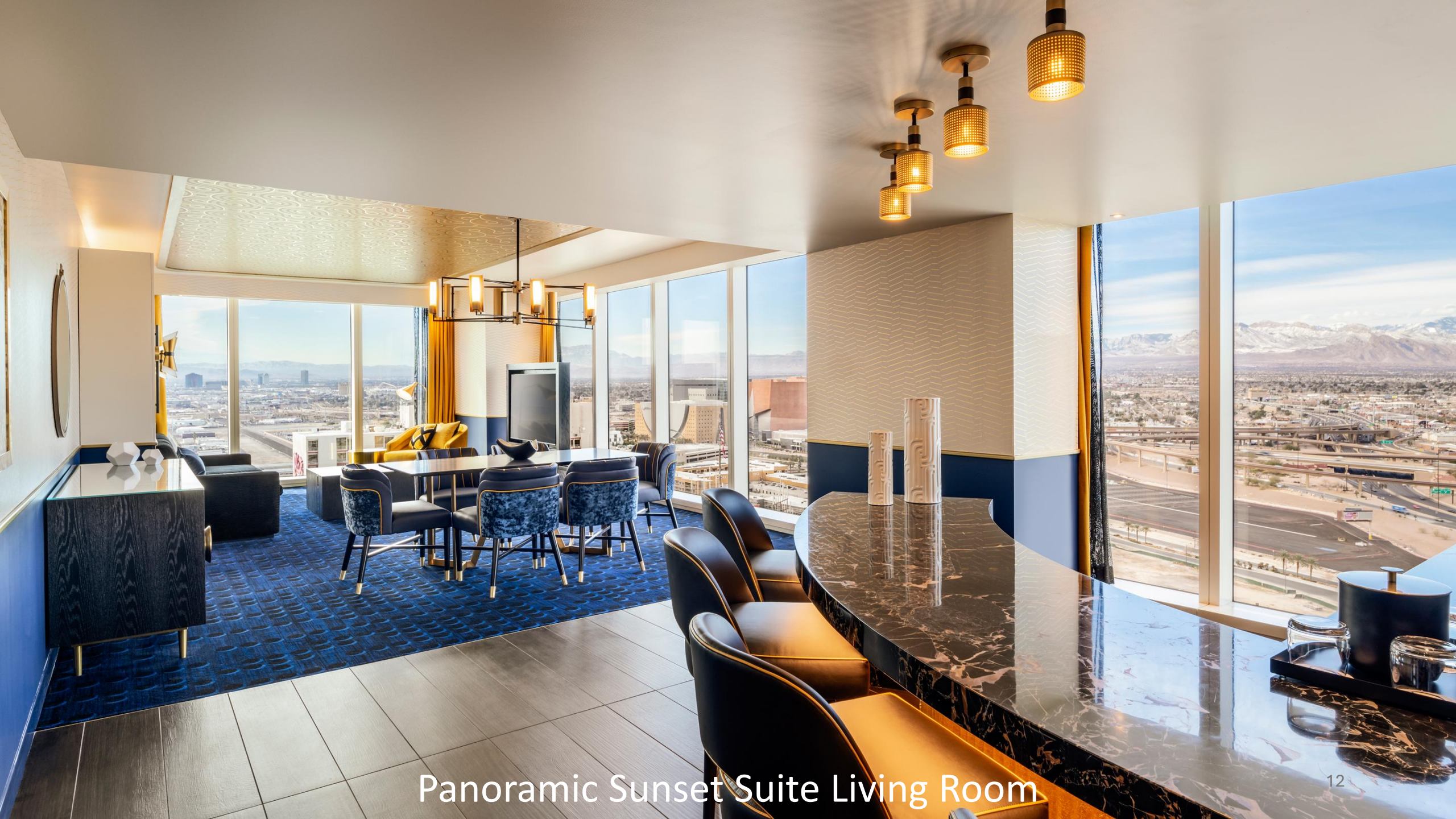
Panoramic Sunset Suite Living Room