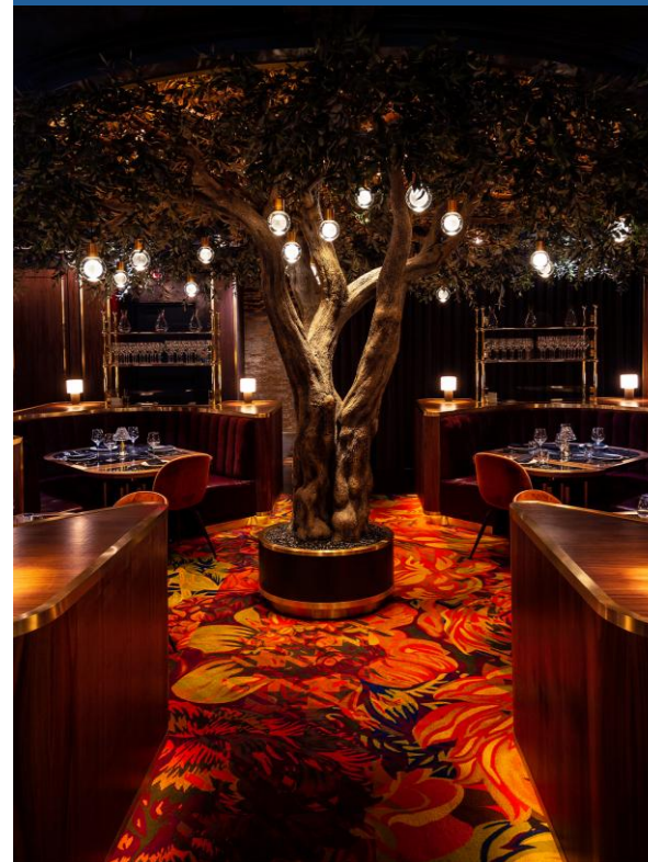
Barry's Downtown Prime