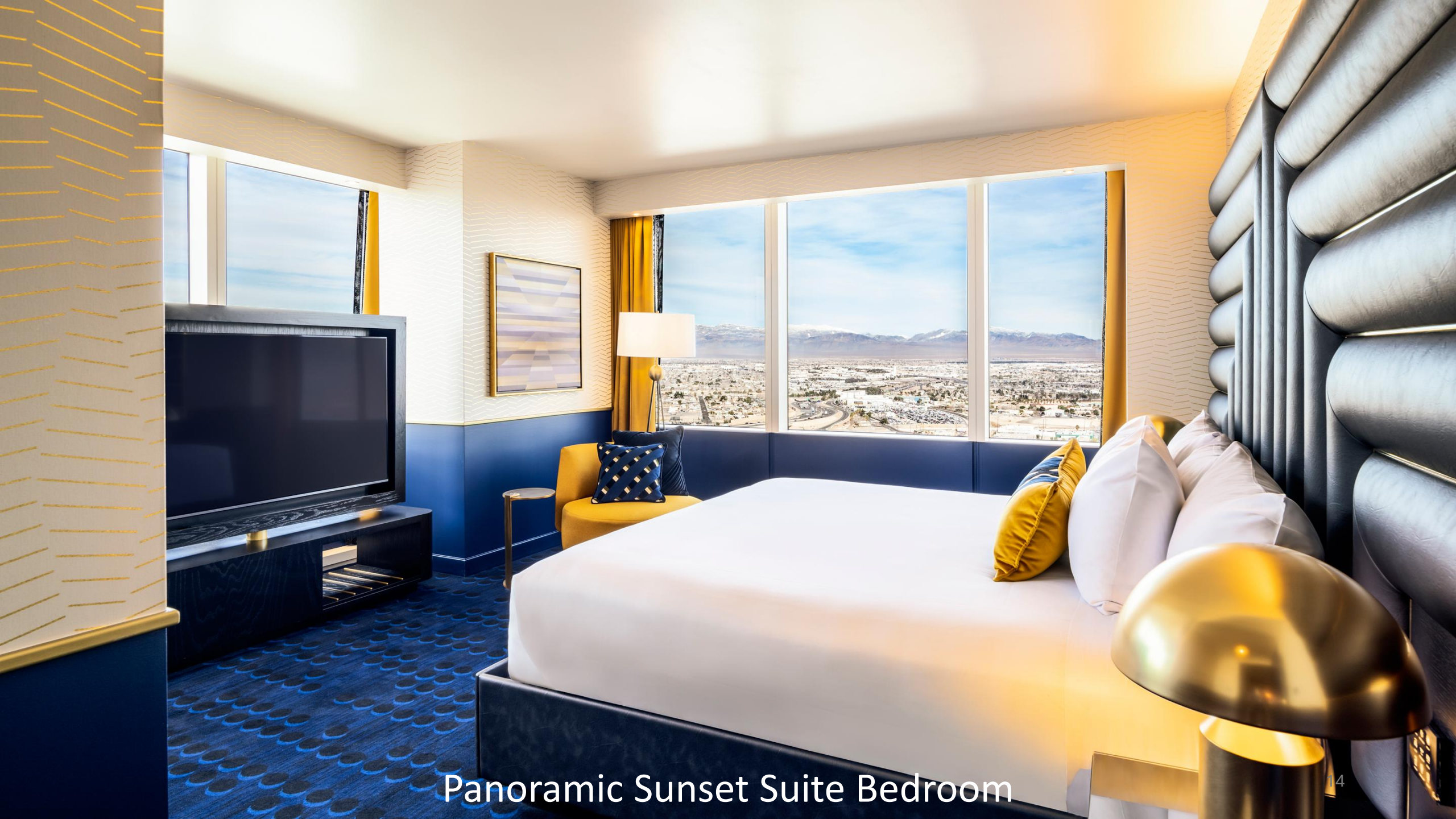
Panoramic Sunset Suite Bedroom